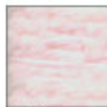
9720 Medium Pink