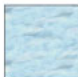
9805 Medium Blue