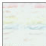
9940 Baby Print