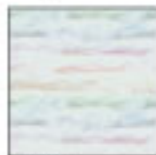
9935 Tropical Fruit