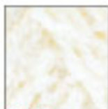
9130 Lemon Cream