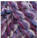
4372 purple mist