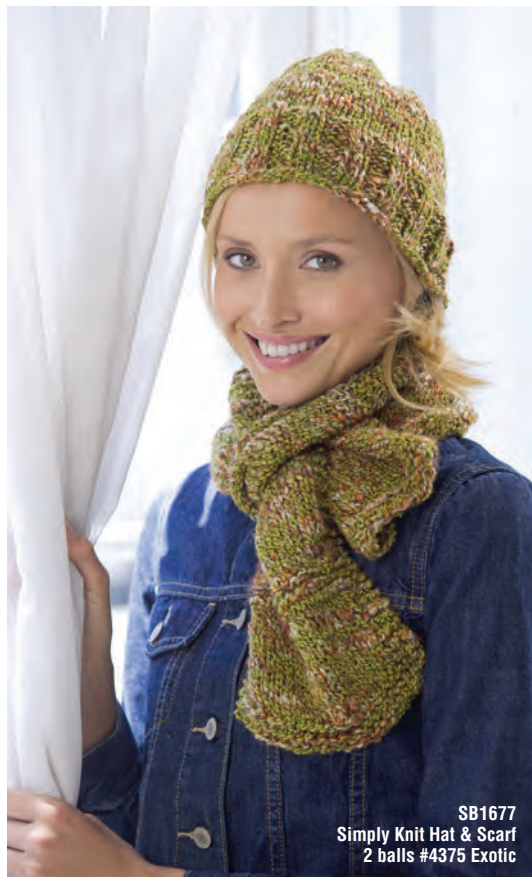
SB1677 Simply Knit Hat & Scarf 2 balls #4375 Exotic