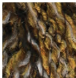
4377 copper mist