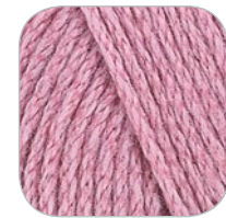
3707 Medium Rose