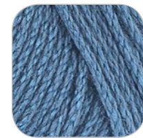
3811 Medium Blue