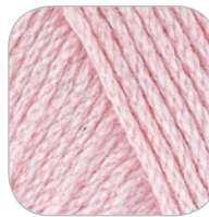
3706 Light Rose