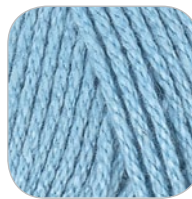
3810 Light Blue