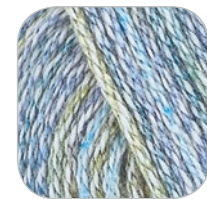
3324 Thistle Multi