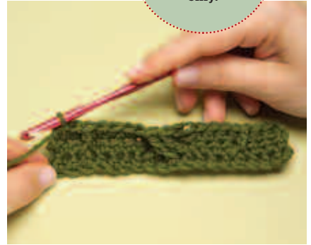
Row 2: completed (note that the second two FPtc now cross in front of the first two FPtc).