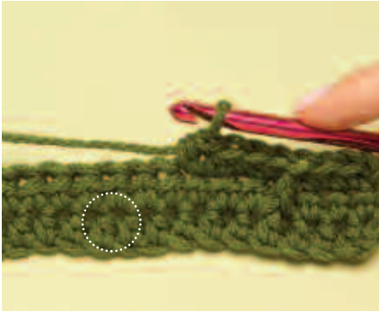
Row 2: First FPtc will be worked into the stitch indicated.