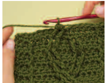
Row 10: after skipping first two FPtc and working into second two FPtc.