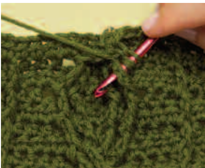
Row 10: working back into the two skipped FPtc.