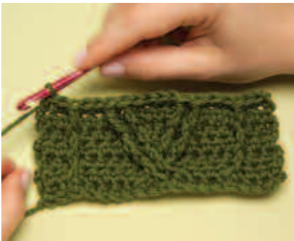
Row 6: completed.