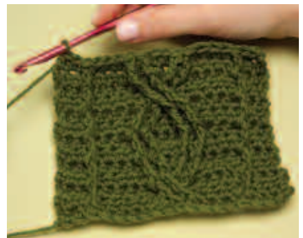
Row 4: worked again, for pattern repeat.