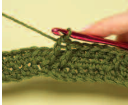
Row 2: after first two FPtc have been worked.