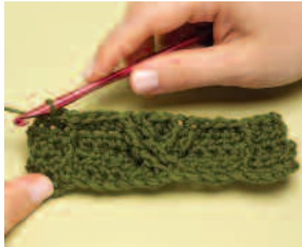
Row 4: completed.