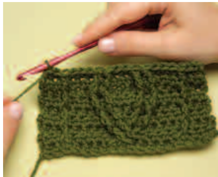
Row 8: completed.