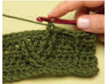
Row 6: after working two FPtc around two FPtc two rows below.