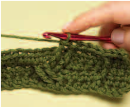
Row 4: after working two FPtc around two FPtc two rows below.