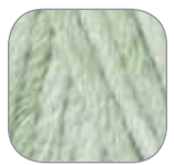
8955 Shaded Lime