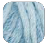
8386 Lt. Ocean