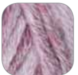
8357 Grape Fizz