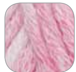
8275 Candy Pink

An extra-thick, but lightweight yarn that's perfect for quick projects such as accessories, bags and outerwear.