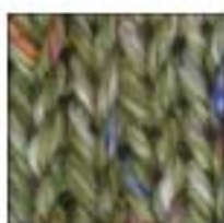
7083 Frosty Green