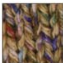
7071 Irish Coffee