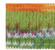
3940 green envy