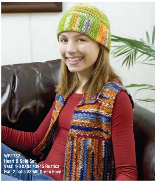
WR1782 Heart & Sole Set Vest: 4-8 balls #3945 Rustica Hat: 2 balls #3940 Green Envy