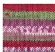
3931 berry bliss