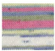
3950 watercolor stripe