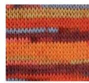
3935 tequila sunrise