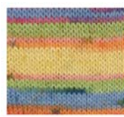
3955 mellow stripe