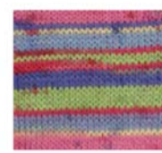
3960 spring stripe