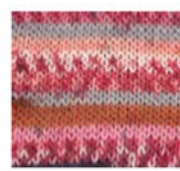
3971 antique rose