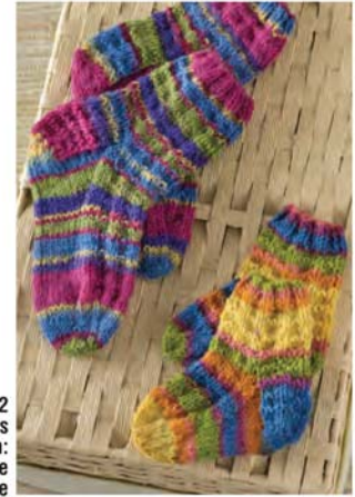
WR1862 Kids & Baby Socks 1 ball each: #3960 Spring Stripe #3955 Mellow Stripe