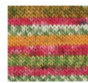
3965 razzle dazzle