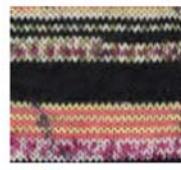
3972 black jack