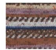
3966 toasted almond