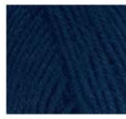
3850 navy blue